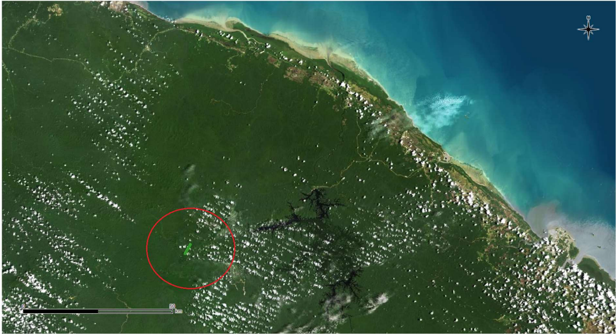
Photo situation 1/ 500 000